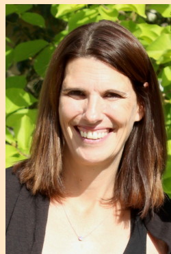
Youth Program Coordinator