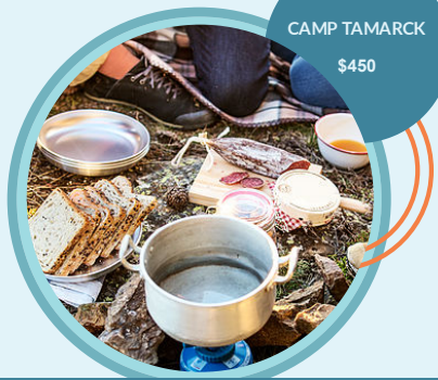
CAMP TAMARCK $450