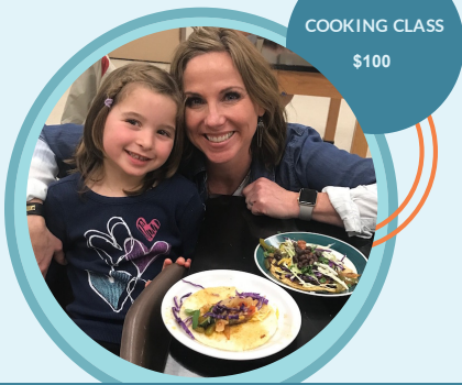
COOKING CLASS $100